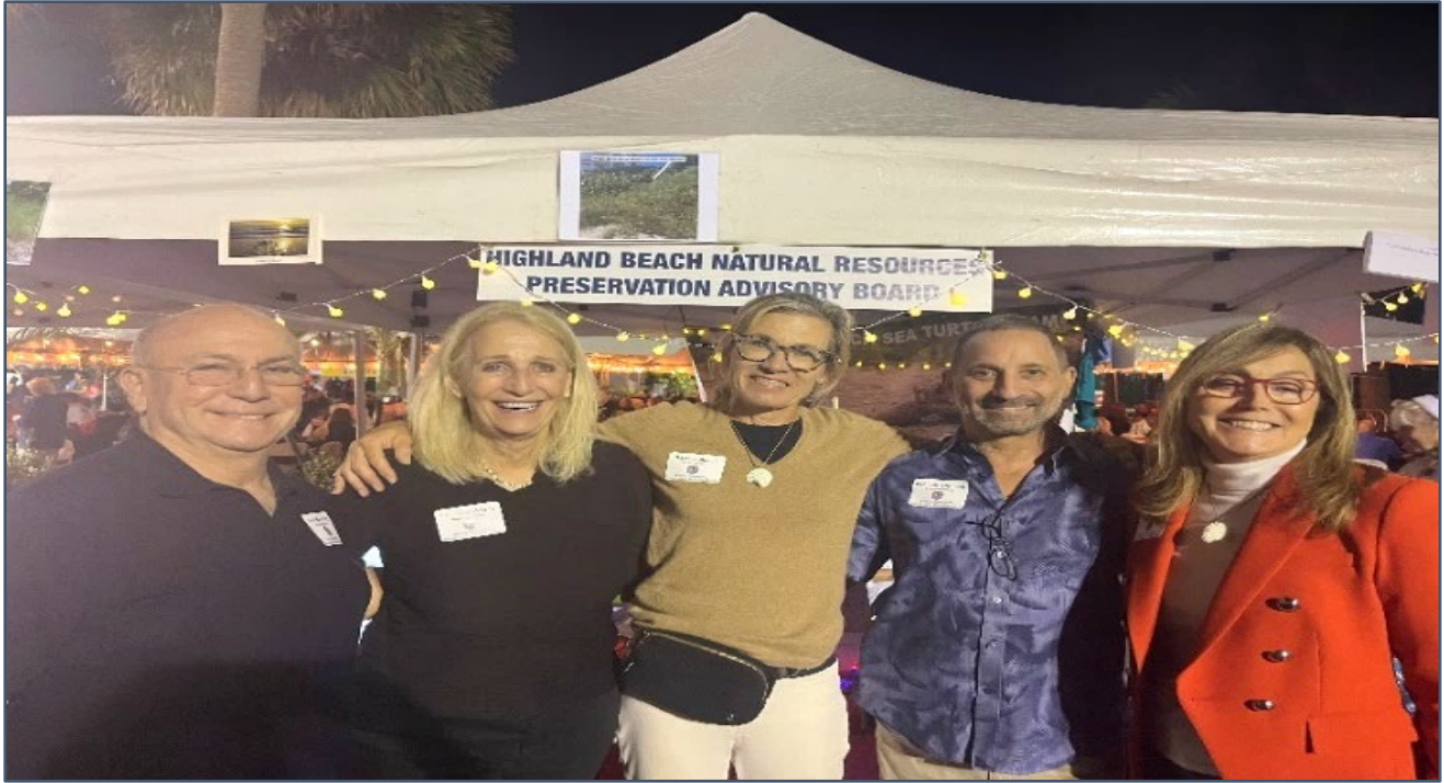
Members of the Natural Resources Preservation Advisory Board at the 75 th Anniversary Mingle & Jingle Celebration.

For information on dune restoration and preservation, recycling, invasive species, sea turtles, and other environmental issues impacting Highland Beach, please visit the Natural Resources Preservation Advisory Board webpage linked below: